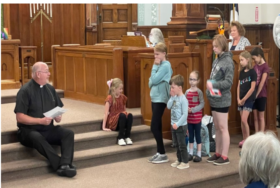
Blessing of the Backpacks

RALLY SUNDAY and hot dog luncheon was held on September 10 th . There was also the Blessing of the Backpacks. Here are pictures of the event, thanks to Tom Robinson, photographer.