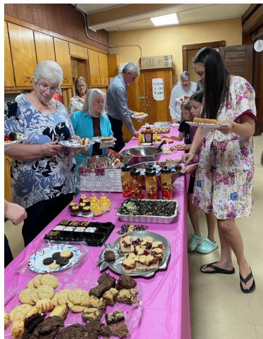
Enjoying the Feast