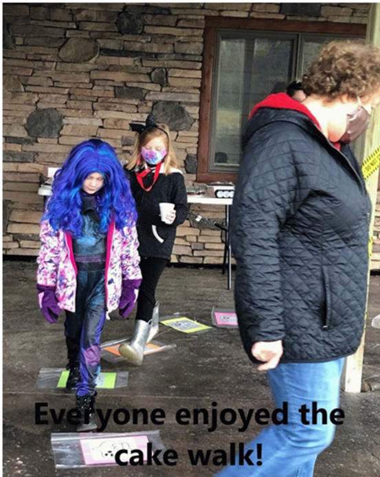
Everyone enjoyed the cake walk!