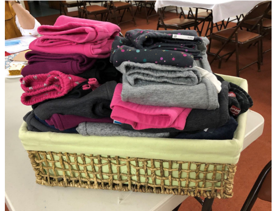
Sweatpants collected and donated