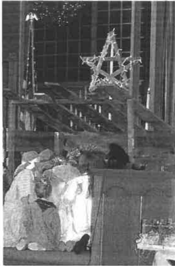
Children worship the baby Jesus in the stable.

In December we practiced and performed "The King's Birthday" pageant. Fifteen children and youth participated in the program. The youngest children played "Twinkle, Twinkle Christmas Star" on the bells, and the older children demonstrated their skills on the bells by playing "Joy to the World". The children sang two songs "Twinkle, Twinkle, Christmas Star" and "Silent Night". The congregation joined in with other Christmas carols, as the children narrated and acted out the Christmas story.