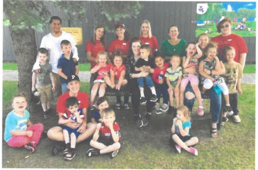
The children on one of their field trips.

Our preschool children have been enjoying going on field trips to the Soo Locks, St. Mary's playground, and to the Community Garden. They have been learning about where our food comes from and how to take care of the garden. They have been enjoying watching the seeds that they planted grow into plants! Our toddlers love the playground and going for walks – we've even had a few days where we got out the sprinkler and played in the water!