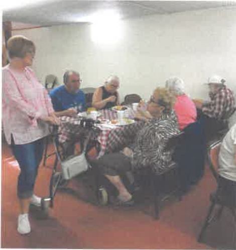
Enjoying the burgers and hot dogs!

1604 W Fourth Avenue Sault Ste Marie, MI Sunday Service at 9:00 a.m.