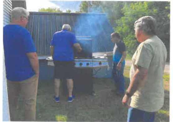
Cooking the burgers and hot dogs with lots of supervision!!

We had our church cookout on Sunday, August 11, 2019. Our United Methodist Women provided the food and the guys grilled the burgers and the hot dogs. A good time was had by all. Here are a couple of pictures of the event.